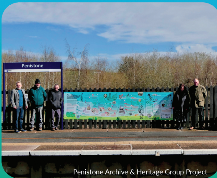
Penistone Archive & Heritage Group Project