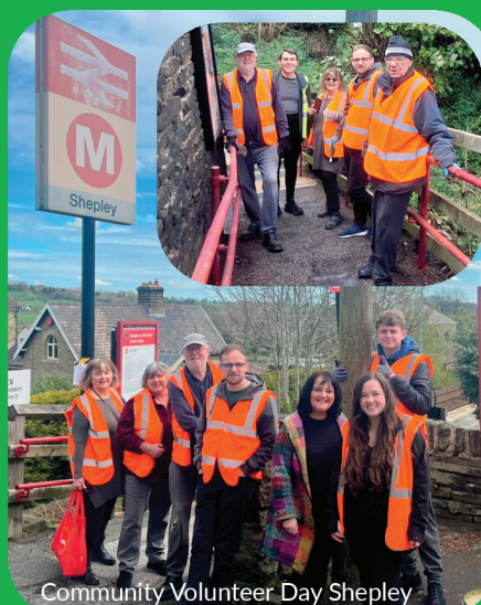
Community Volunteer Day Shepley