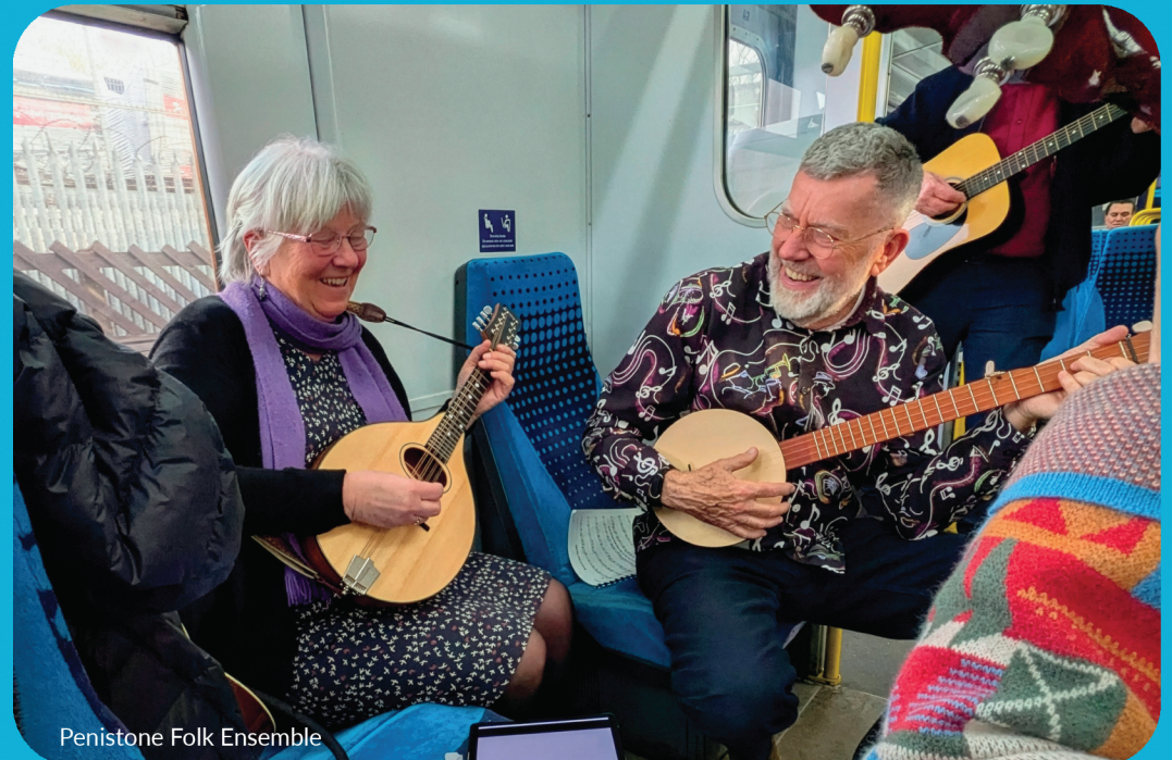
Penistone Folk Ensemble

We hope to create something special in the near future and repeat the experience during Penistone Art Week's 10 th Anniversary in 2027.