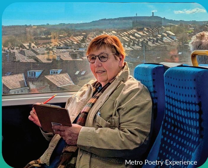
Metro Poetry Experience