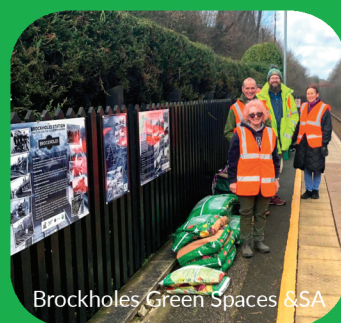
Brockholes Green Spaces & SA