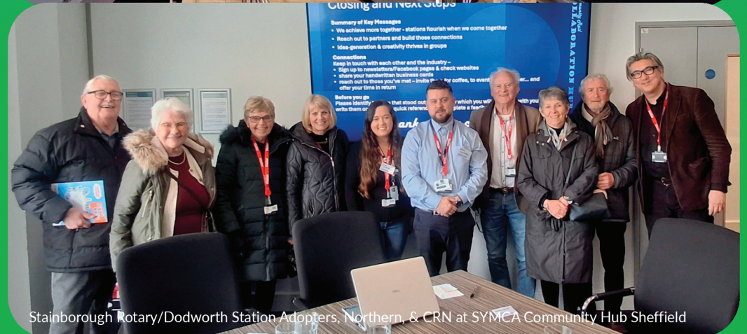
Stainborough Rotary/Dodworth Station Adopters, Northern, & CRN at SYMCA Community Hub Sheffield