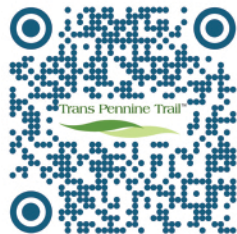
SCAN FOR TRANS PENNINE TRAIL INFO

The Trans Pennine Trail is a national coast to coast route for walkers, cyclists and (in some places) horse riders, and links the North and Irish seas. It forms part of the European walking route E8. Cyclists can join the National Cycle network on route 627 from Stockmoor and Shepley stations. There is access to the Trans Pennine Trail directly behind Penistone Station.