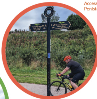
Access point Trans Pennine Trail Penistone Station

There is no paid membership needed to join us. If you would like to help communities get the most out of their local station, consider becoming a committee member. If you love gardening, helping host events, or are creative, and you have time to volunteer please contact us on 07912 753817 to find out more or scan the QR code below.