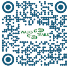
SCAN FOR SELF GUIDED WALKS

The Trans Pennine Trail is a national coast to coast route for walkers, cyclists and (in some places) horse riders, and links the North and Irish seas. It forms part of the European walking route E8. Cyclists can join the National Cycle network on route 627 from Stockmoor and Shepley stations. There is access to the Trans Pennine Trail directly behind Penistone Station.