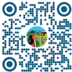
SCAN FOR OUR GUIDED WALKS PROGRAMME

If you prefer a self-guided walk then visit our website, where we have links to many trails accessible from the Penistone Line in Kirklees, Barnsley, and North Sheffield. Follow routes such as The Five Weirs Walk near Meadowhall, the Holme Valley Circular, or those from the many 'Walkers are Welcome' routes directly from the station around beautiful areas such as Denby Dale.